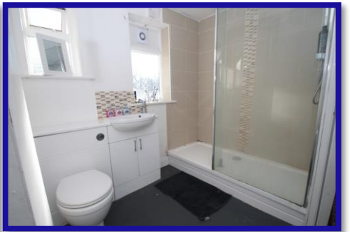
177 Southfield Road, , Middlesbrough, TS1 3HF £155,000